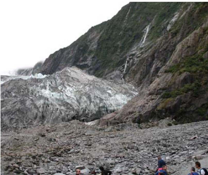
The toe of the Franz Josef glacier