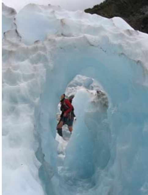
A hiker looks through the remnants of an uncovered englacial channel at the Franz Josef glacier in New Zealand