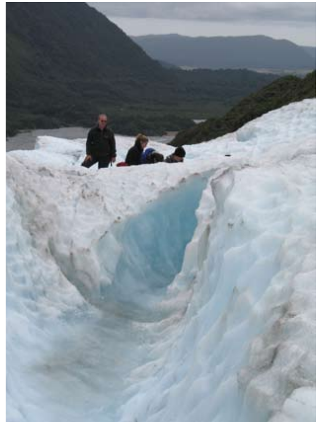
Visitors examine a supraglacial channel

BAD LATITUDE IS RECRUITING: JOIN OUR TEAM FOR ICE WARS ON NOVEMBER 20TH