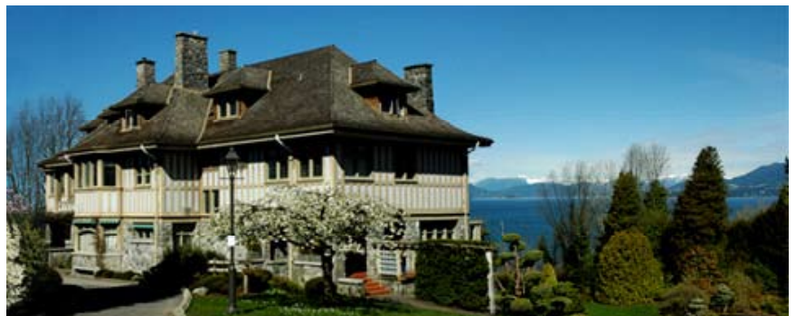
Cecil Green Park House - the classy, cliffside location of this year's Geogala